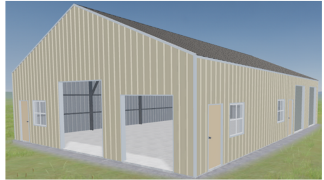
RAPID Steel Buildings are easily designed using online modeling software